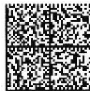
Chief Executive Officer Kenya National Examinations Council

EXAMINATION OF 2015 PRINTED : 161019:11330905